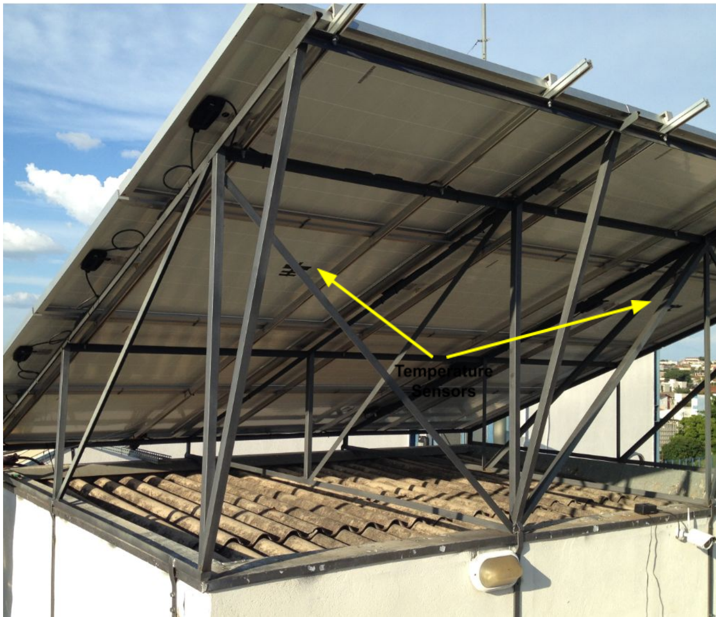
Fig4: Distribution of Temperature cells of photovoltaic system 3,1kW