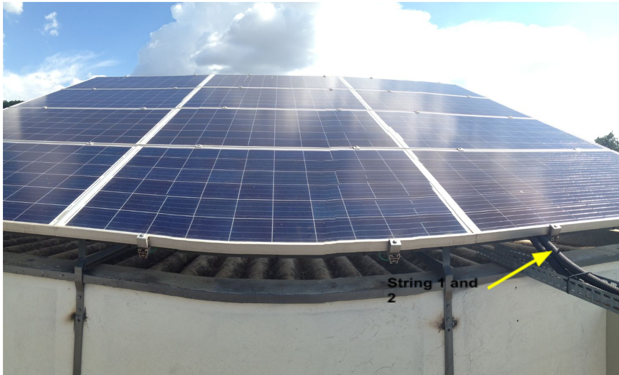
Fig2: Distribution of Photovoltaic panels for (Power of 3,1kWp)